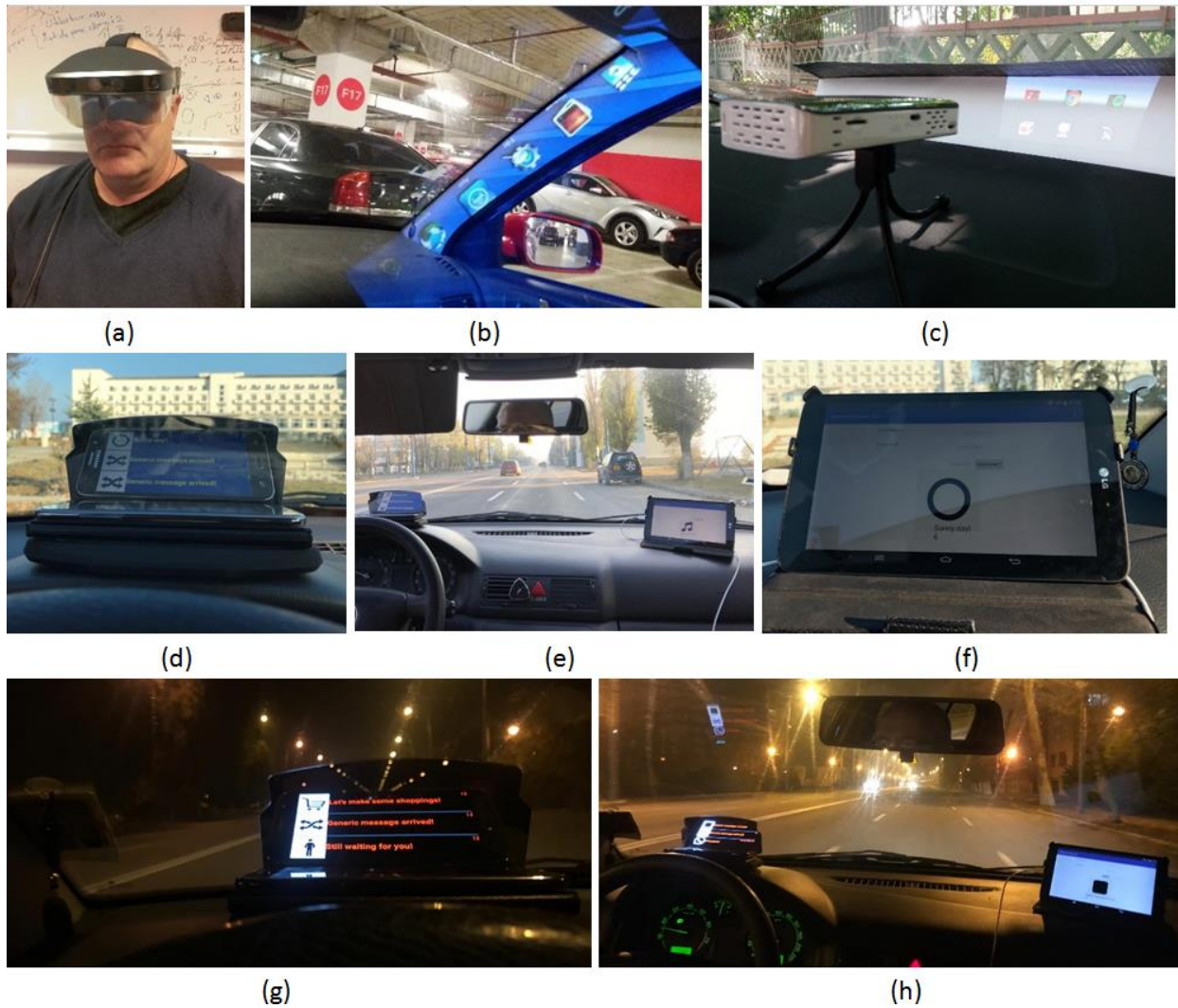
Figure 3. Exploring various configurations for visualizing information inside the vehicle.